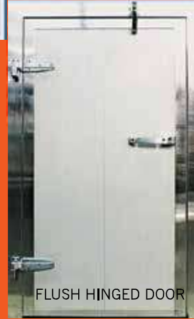
FLUSH HINGED DOOR