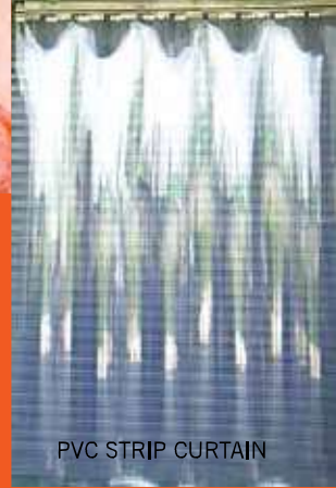
PVC STRIP CURTAIN